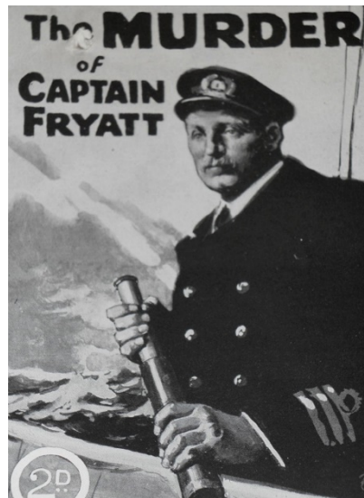
Front cover of booklet, MT 9/1066 The National Archives

As First Lord of the Admiralty, Churchill realised that the war at sea was rapidly becoming a fight for the survival of the fittest – total war by any means - and issued orders accordingly to Masters of Merchant Ships to take whatever actions were necessary in defence of their ships, and Germany's policy of unrestricted submarine warfare against merchant ships justified them in treating the crews of U-boats as criminals and not as prisoners of war. He also ordered that, if a merchant ship surrendered, the Master would be prosecuted. To Captain Fryatt, the heroic adventure was just beginning.