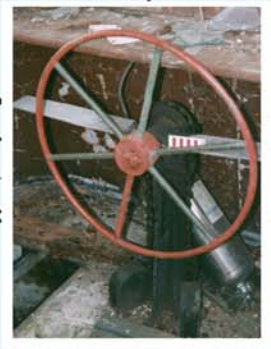
Helm and Port access to forward cabin