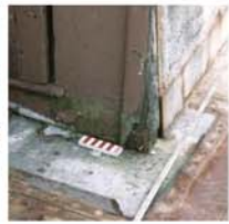
Later wheel house positioned over earlier hatch