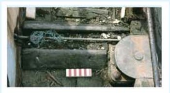
Ruddimentry wire run & pulley for steering