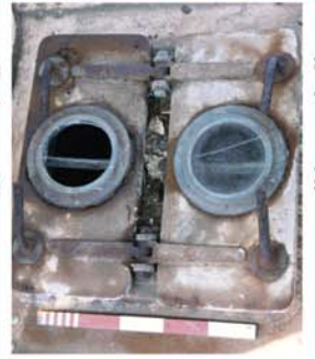
Ventilation hatch for engine room