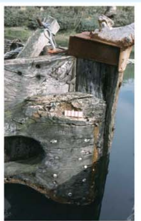
Stempost with roller fairlead and inscription with admiral's broad arrow and the number 3816.