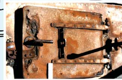
Hatch access to engine room