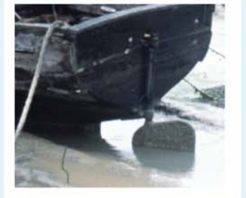
Transom and Rudder