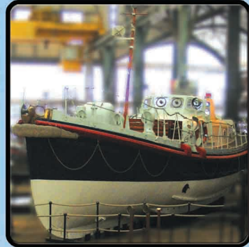
A Barnett Class Lifeboat in Chatham Dockyard

In 1892 the Training Ship Mercury , a school that trained boys for life at sea, came to the Hamble. With it came a small fleet of craft, including Fortuna and Flash , believed to be two former North Sea trawlers that were converted into hospital ships some time prior to 1913.