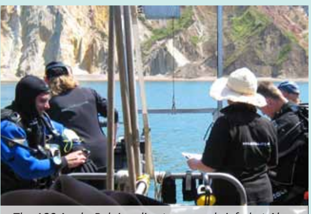
The A2S Anglo-Belgian dive team are briefed at Alum Bay prior to an archaeological dive in 2010.