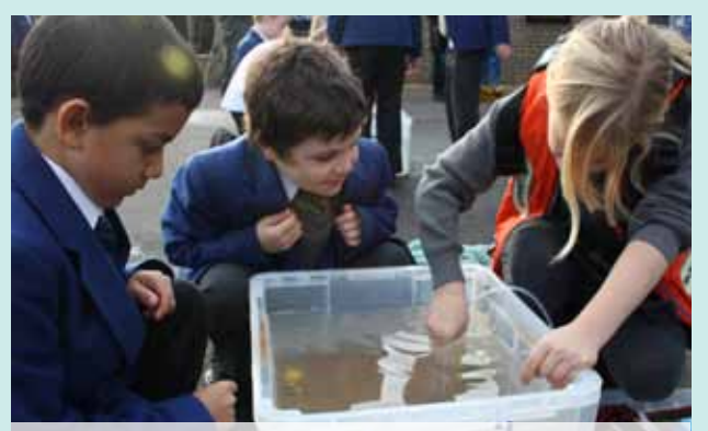
Schoolchildren experiment with a miniature airlift during a Maritime Bus visit as part of the ENA Project.

Groups of pupils in each country worked with the resources and partner staff over six weeks to discover the identity of a wreck which had links and significance to each of the countries. Resources created for the 3-nation schools programme were subsequently adapted to provide a hands-on day of activity, focused on the Maritime Bus, for 9/10 year olds at a primary school in Norwich (right).