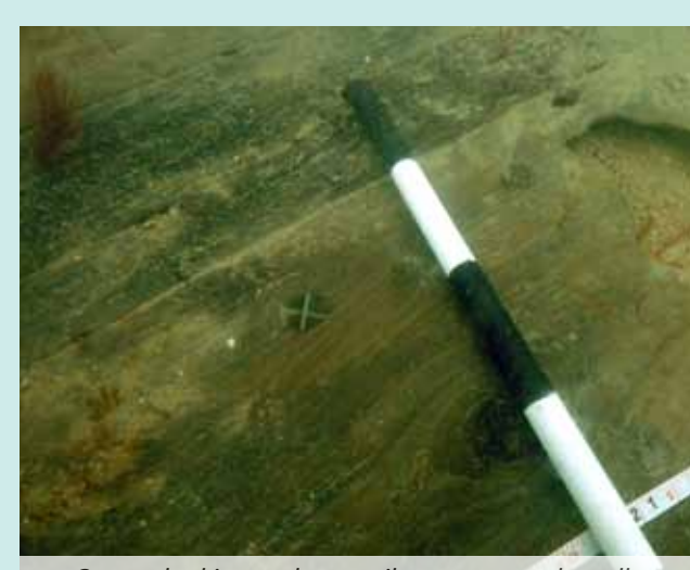
Outer planking and treenails are extremely wellpreserved within the Alum Bay 2 shipwreck.

Further information at: www.hwtma.org.uk/alum-bay