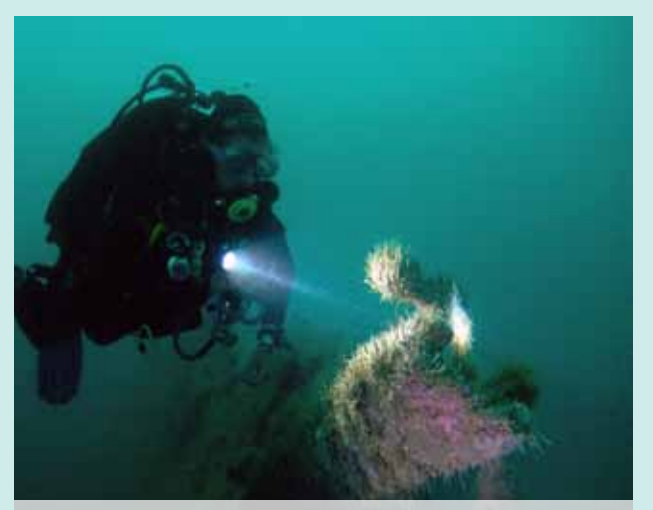
Diving on the well preserved remains of the clipper Smyrna (1888) was one of the highlights of the A2S diving fieldwork