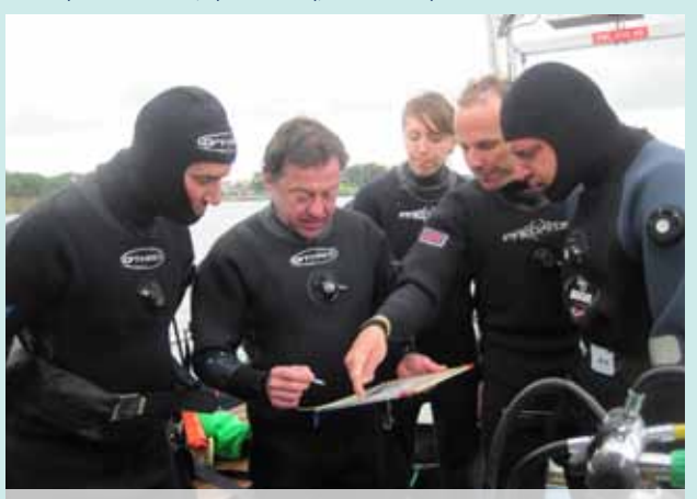
Final briefing before diving in the Western Solent.