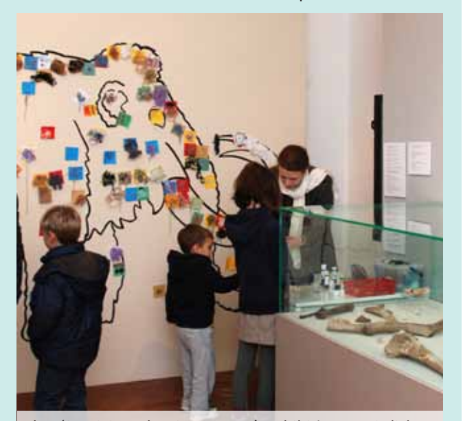
The 'Surviving the Stone Age' exhibition at Salisbury Museum, including material from Bouldnor Cliff was attended by over 4,500 people.

The HWTMA continues to work closely with the other visitor attractions at Fort Victoria, Isle of Wight County Council and the West Wight Landscape Partnership. Over the coming months significant investment is being made into the infrastructure of the Fort with better signage, refurbished toilets, roof and wall repairs, path improvements, undercover outdoor areas for schools and groups, plus a general all round paint job and a gun mounted on a replica carriage in a restored casemate. This major investment aims to attract more people to the fort and enhance the overall visitor experience.