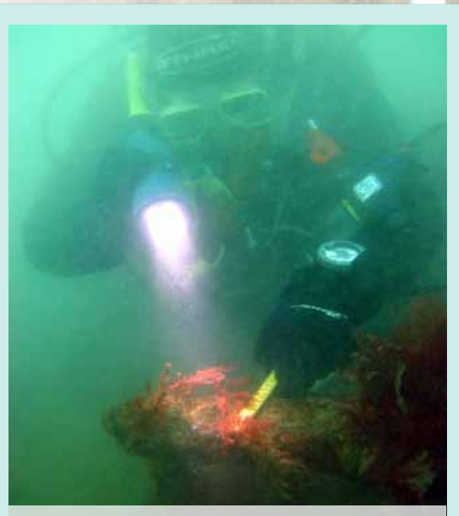
HWTMA diver working on the Alum Bay 1 shipwreck.