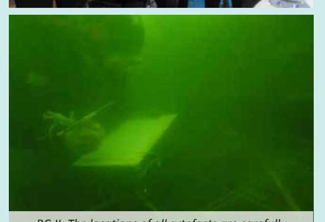
BC-II: The locations of all artefacts are carefully recorded, even in poor visibility, before they are raised.