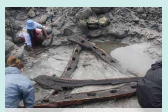
Archaeological investigation revealed extensive wooden elements forming part of the fish trap remains at Servel.

At Bouldnor Cliff a series of erosion surveys were conducted along a 500m stretch of submerged cliff. Further evidence of human activity was discovered at both BC-II and BC-V, including the exposure of more worked wooden material at BC-V. These finds provide tangible evidence of human occupation on a site that was lost to coastal change as the sea rose over 8 millennia ago.